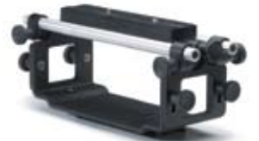
Rod Accessory kit installed on Exo-skeleton

Tabletop Ki Pro Mini Stand and Adapter Cable – This stand securely holds the Ki Pro Mini upright on a desk, shelf, or any flat surface. A right angle power cable is provided for easy connection between the power supply and the Ki Pro Mini.