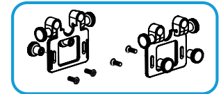
Rod Accessory kit